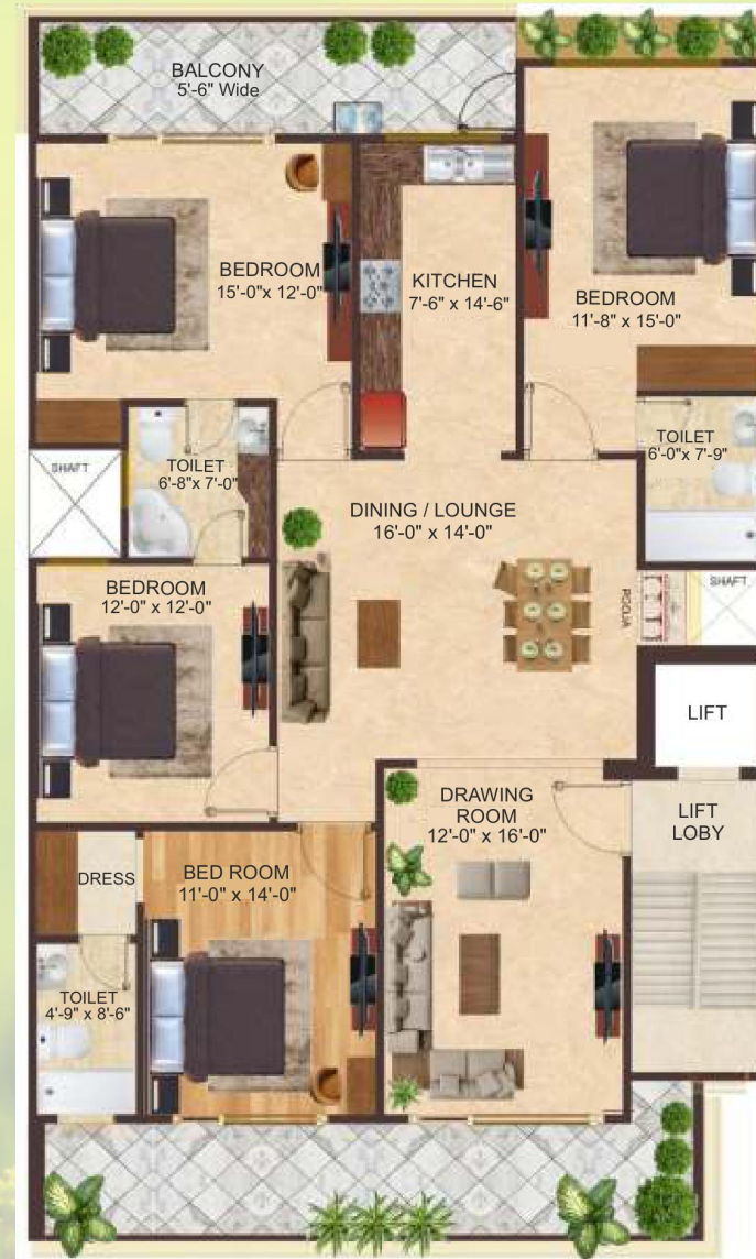
FLOOR PLAN LAYOUT