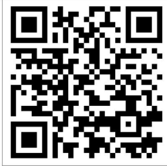
Google Map Direction