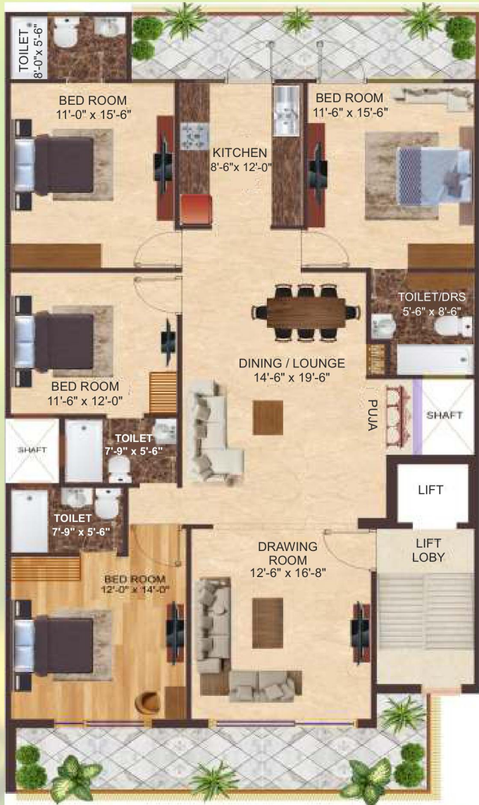
FLOOR PLAN LAYOUT