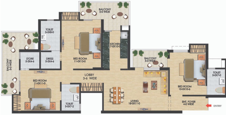
1685 SQ.FT. 3 BED ROOM + 3 TOILET + DRESS + STORE + ENTRANCE FOYER