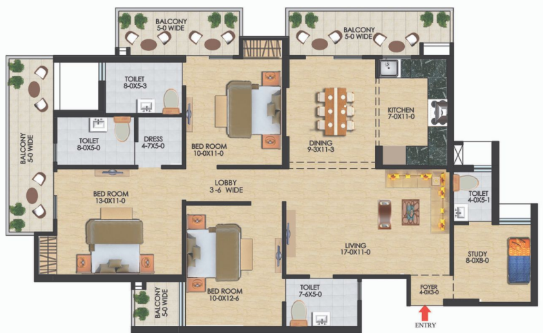
1880 SQ.FT. 3 BED ROOM + 3 TOILET + DRESS + SER. ROOM + W.C. + DINNING + ENTRANCE FOYER