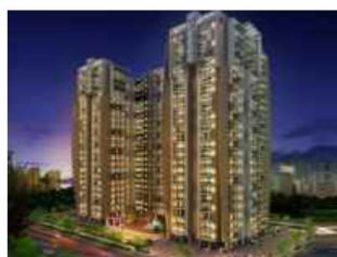
Apex The Florus