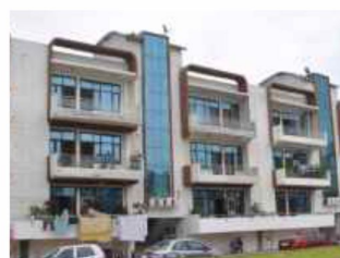
Apex Royal Castle