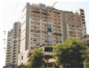
Apex Green Valley