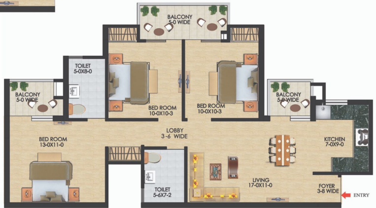
1295 SQ.FT. 3 BED ROOM + 2 TOILET