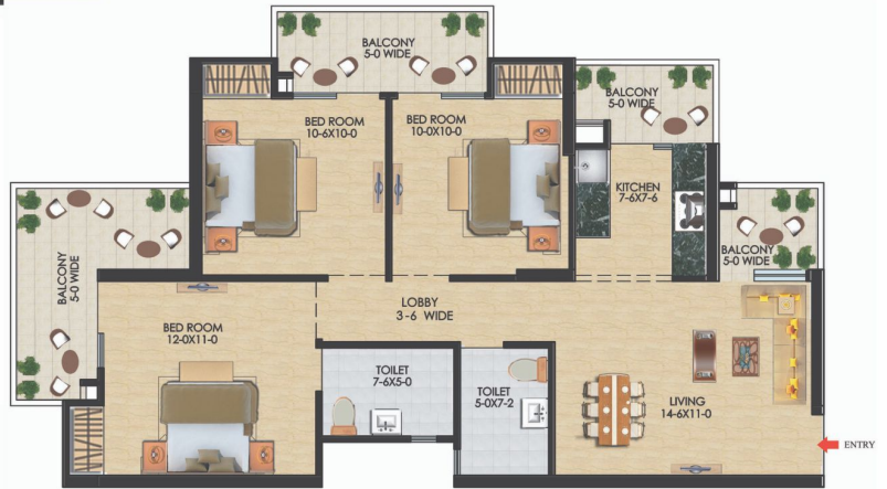
1290 SQ.FT. 3 BED ROOM + 2 TOILET (CORNER)