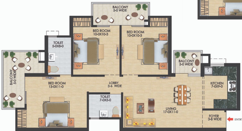
1340 SQ.FT. 3 BED ROOM + 2 TOILET