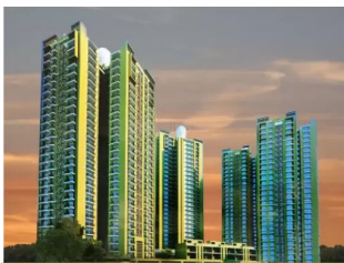
Apex Golf Avenue