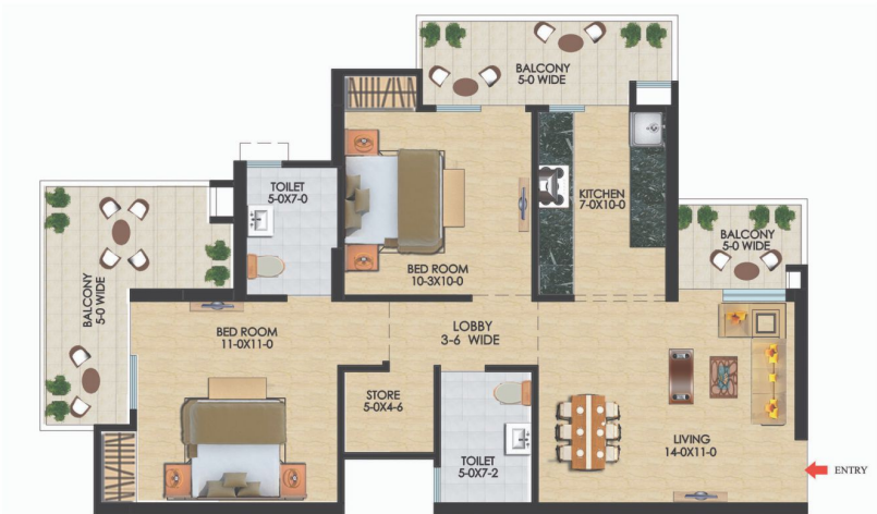
1140 SQ.FT. 2 BED ROOM + 2 TOILET + STORE