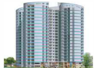
Apex Acacia Valley