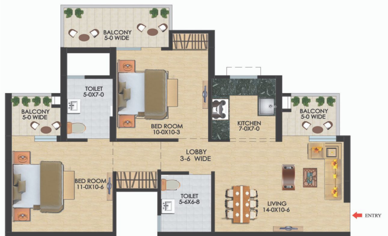
972 SQ.FT. 2 BED ROOM + 2 TOILET