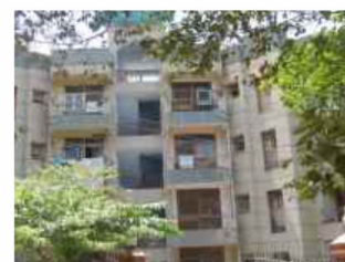
Media Times Apartments