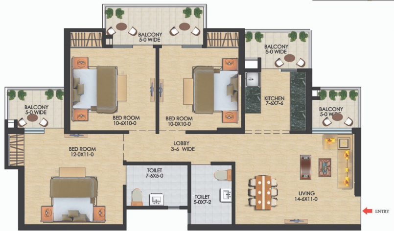
1240 SQ.FT. 3 BED ROOM + 2 TOILET