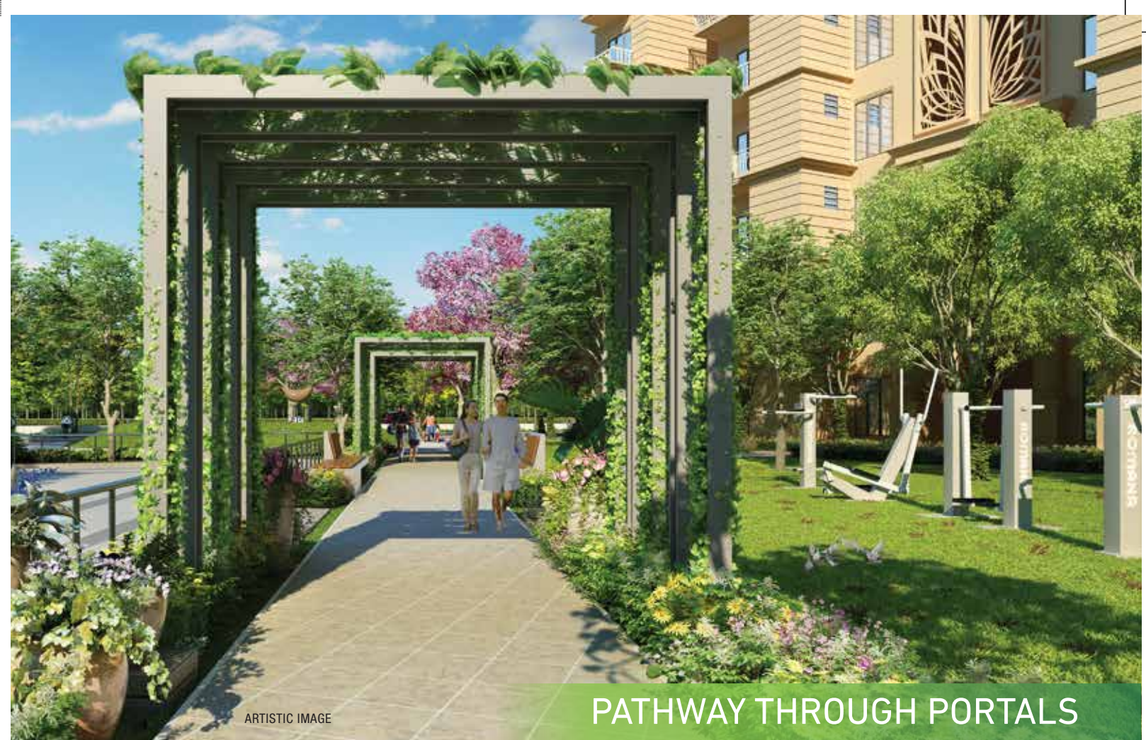
PATHWAY THROUGH PORTALS